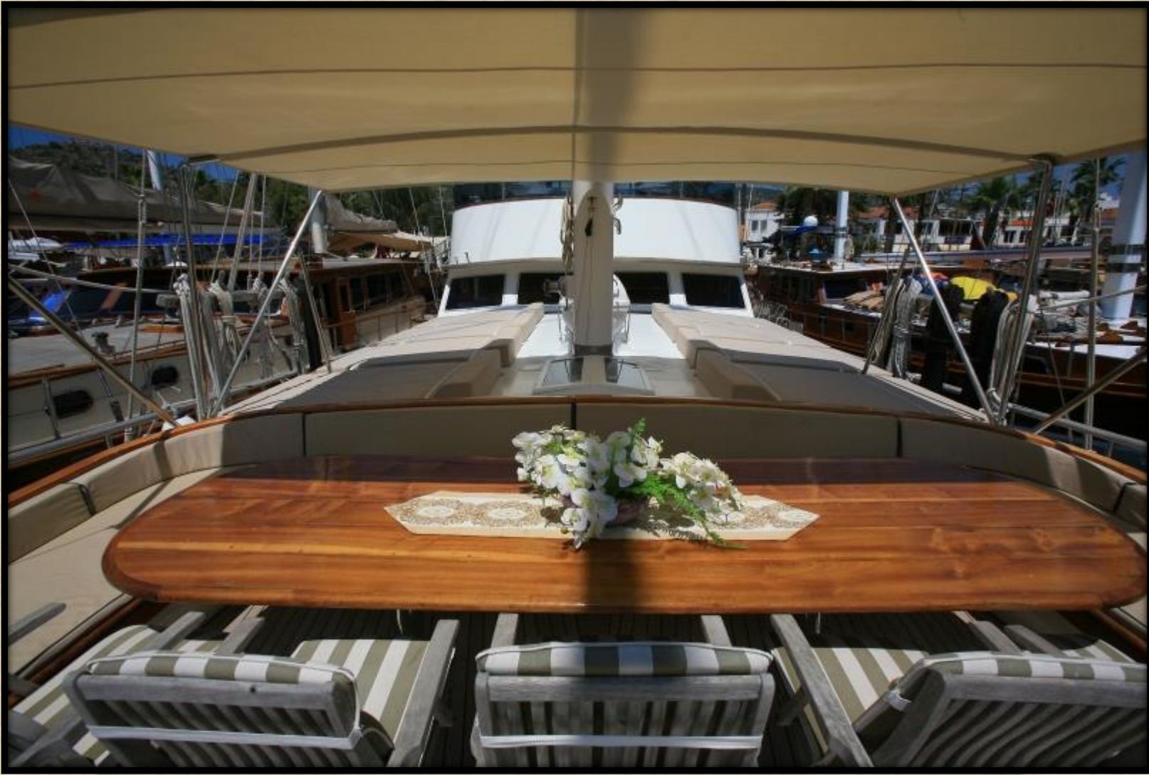
View of the forward seating and dining area