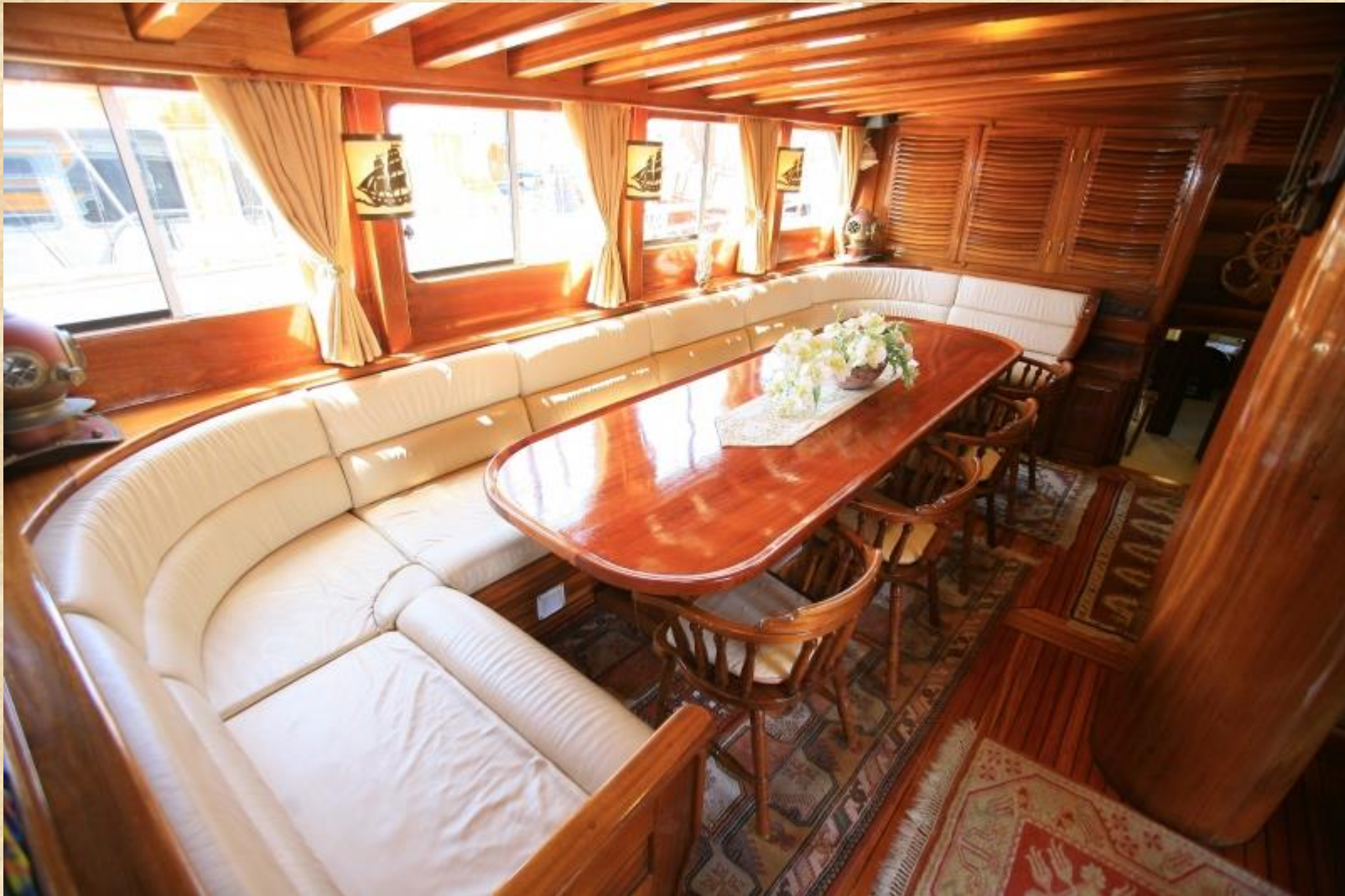
View of the saloon which also has an open bar area