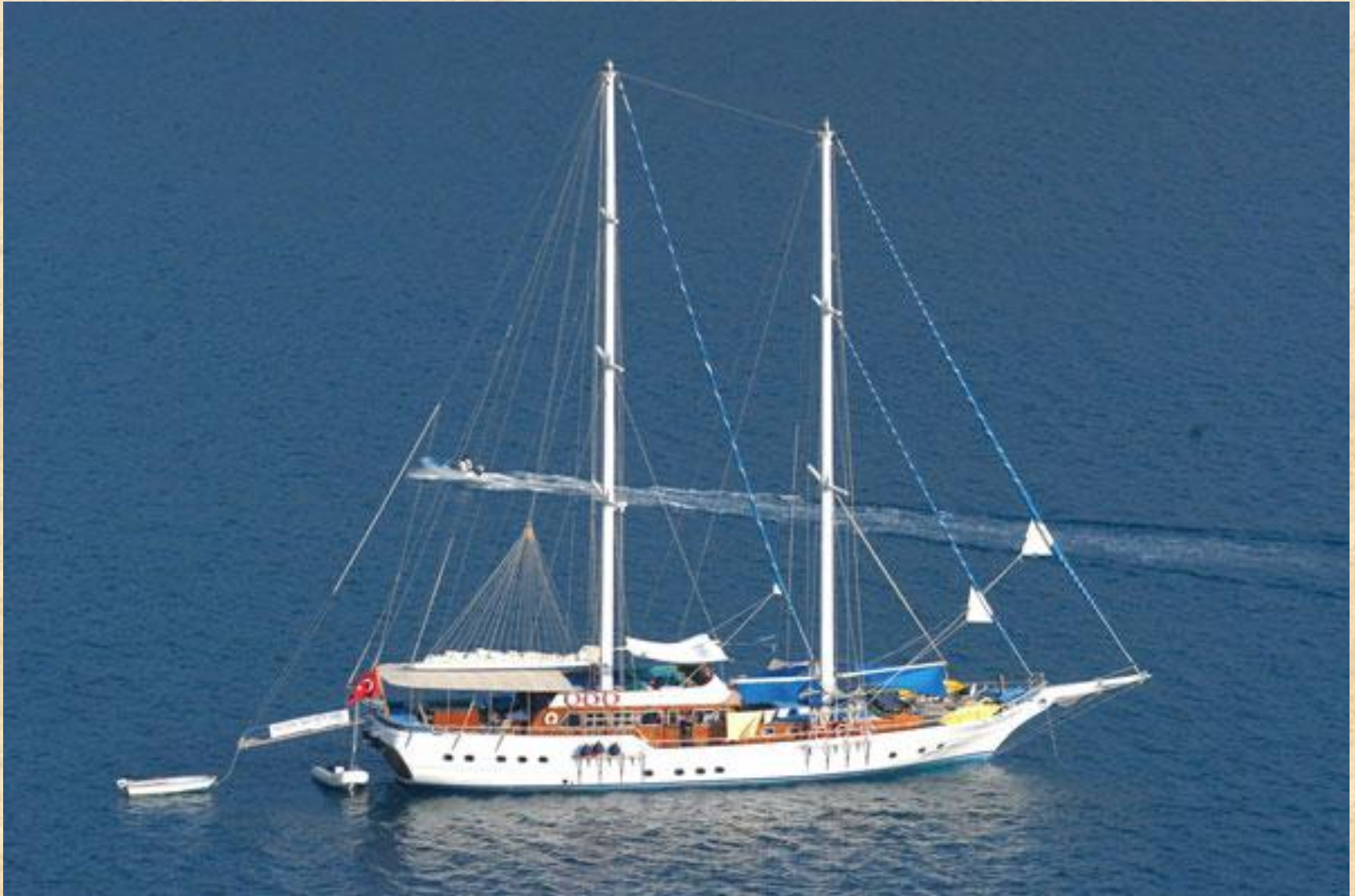
Southern Cross Blue Cruising