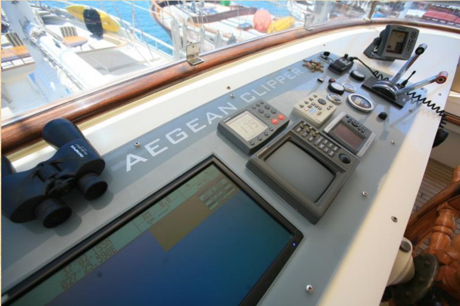
Southern Cross Blue Cruising