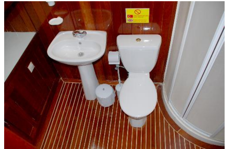
Home-style bathroom & shower