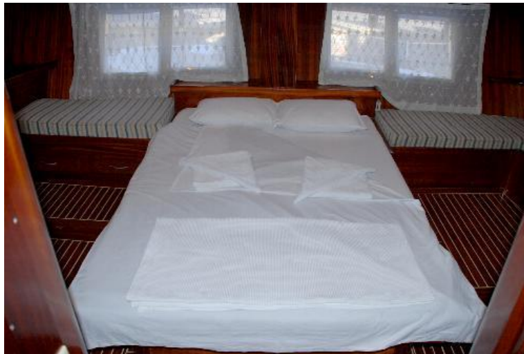
Aft master cabin