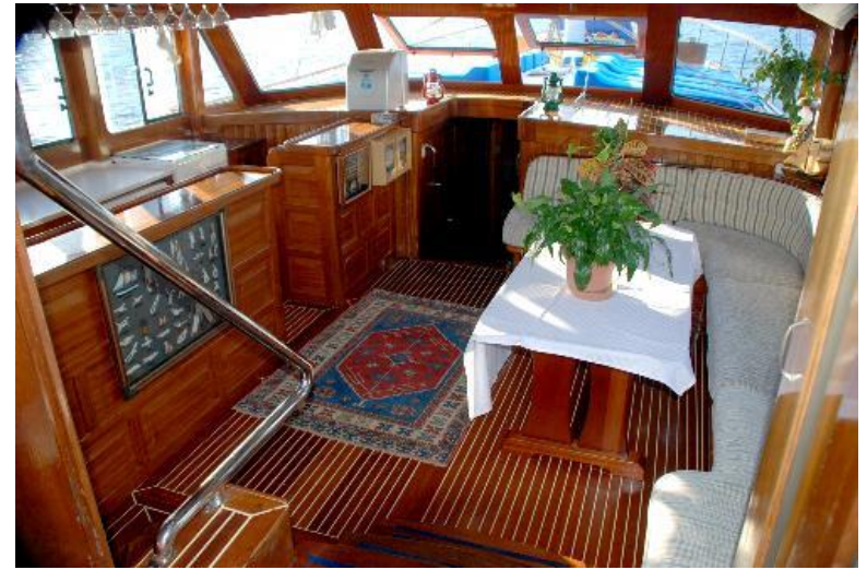
Saloon and companionway