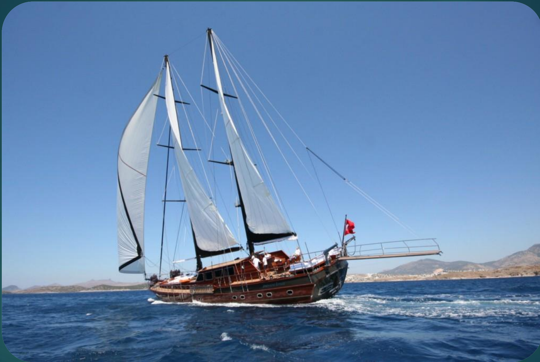
Southern Cross Blue Cruising